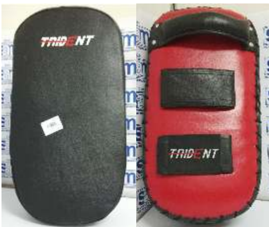
TRIDENT KICK SHIELD RM 139.00 PER PC (WRUN)