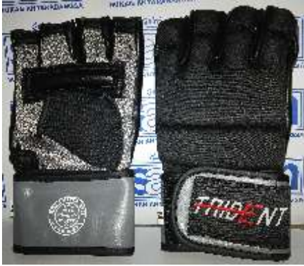
TRIDENT MMA GLOVES MMA501 FUWL @ RM 75.90