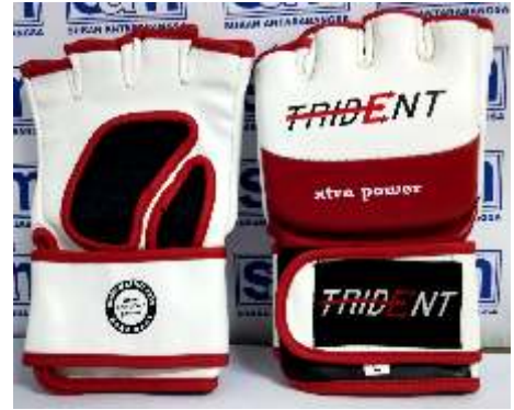
TRIDENT MMA GLOVES MMA505 FEFL @ RM 85.90