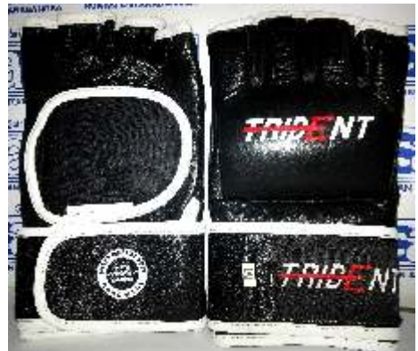
TRIDENT MMA GLOVES MMA512 OLGL @ RM 115.90