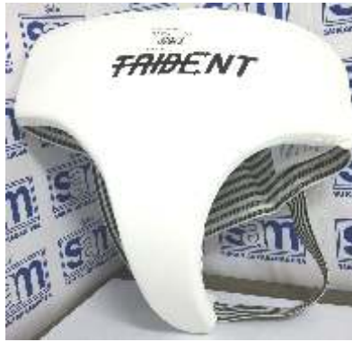
TRIDENT GROIN GUARD WOMEN: RM 42.00 (UNRF) MEN: RM 39.00 (UGUN)