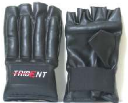
TRIDENT PUNCHING MITTS UGUN (RM 39.90 PER PAIR)