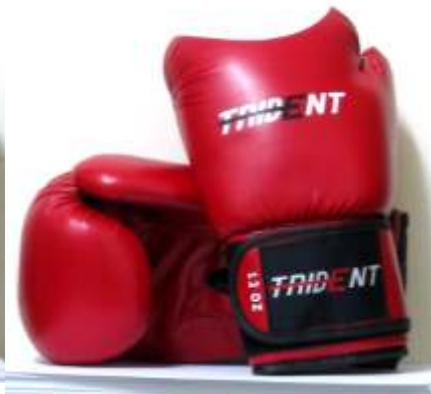
TRIDENT BOXING GLOVES

SYNTHETIC 10oz (RM 89.00 PER PAIR) LXWN 12oz (RM 95.00 PER PAIR) LFSL 14oz (RM 99.00 PER PAIR) LOFN