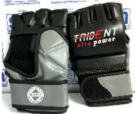
TRIDENT MMA GLOVES MMA508 FUWL @ RM 75.90