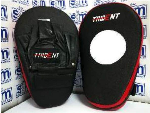
TRIDENT FOCUS PAD RM 169.00 PER PAIR (RONG)